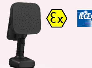
Sorama CAM iV64Ex