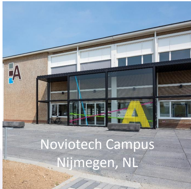
Noviotech Campus Nijmegen, NL