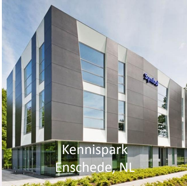
Kennispark Enschede, NL